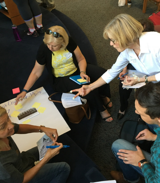
Members of Sacred Solidarity congregations participate in anti-racism action and reflection.

Preparing faithful leaders and communities with the skills needed to act powerfully for the common good.